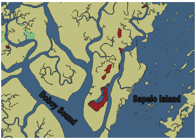
Figure 1. Back-barrier islands sampled in McIntosh County, GA are indicated by shading.

We conducted a series of field observations within and near the Georgia Coastal Ecosystems Long Term Ecological Research (GCE LTER) site at Sapelo Island, Georgia, during the summer and fall of 2002 (Fig 1). The back-barrier islands were selected on the basis of accessibility, minimal impact from residential or agricultural development, natural origin (as opposed to dredge spoil) and size. Back-barrier islands were identified using an ESRI ArcView v.3.2 map database provided by the Georgia Dept. of Natural Resources