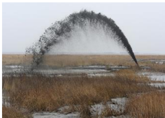
Figure 2. TLP of dredged material using high pressure hydraulic spray during restoration of marshland in the Blackwater National Wildlife Refuge, Maryland.

Decisions about dredge material placement method and the need for containment structures are made during the design phase. Hydraulic dredges use pumps to suction material off the bottom sediment in a slurry (mixture of sediment and water) and propel it via pipeline to the placement site (Reed et al. 2012). The sediment can then be distributed via either low- or high-pressure spraying. In low pressure hydraulic dredging, sediments are softened and liquefied but not slurried. Consequently, the heavier sand and gravel substrate components are deposited nearest the discharge point, resulting in uneven topography. When high-pressure hydraulic application is used, the sediment slurry remains well mixed, which allows for a more uniform topography and grain size distribution (Schafer 2002). The high-pressure spray nozzle can be aimed in any direction so that the dredged material can be deposited discontinuously to avoid small natural drainage streams or sensitive habitats (Cahoon and Cowan 1988) (Fig. 2). In addition, high-pressure hydraulic sprayers can deposit sediments up to 76 m wide as compared to conventional techniques that have disposal widths of around 23 m (Randall et al. 2000). High-pressure hydraulic dredging can also be used in shallow, open water to spread very thin layers of material over a large area (Bailey 2005; La Peyre et al. 2009; Slocum et al.