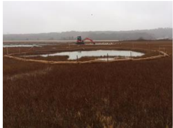
Figure 3. Example of the use of bagged oyster shells as containment for TLP of dredged sediment on marshland in the John H. Chafee National Wildlife Refuge, RI.

Site-specific conditions determine the optimum thickness for TLP additions to distressed marshes. Dredged material must be applied at sufficient elevation to allow for growth of native vegetation and benthic organisms. This requires a balance: if the sediment placements are too thin vegetation may not be able to become established, especially in high energy areas (VIMS 2014). On the other hand, when application of dredged material is too thick marsh elevation may rise to a level that is too high for vigorous plant growth, leaving the marsh vulnerable to invasive species (Wilber 1992a). A too thick application may also smother benthic organisms. In the 26 case summaries examined for this report, the optimum depth of dredged material ranged from 10-15 cm (Nester and Rees 1988; Wilber 1992c; Schrif