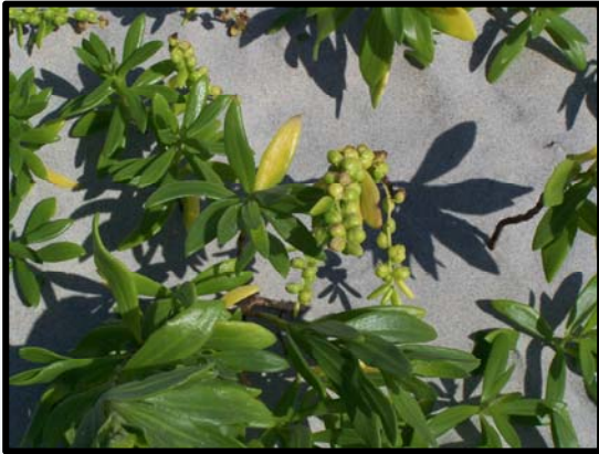
Sea Elder ( Iva imbricata )