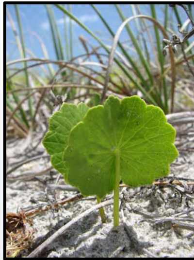
Pennywort ( Hydrocotyle bonariensis )