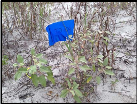
Beach Croton ( Croton punctatus )